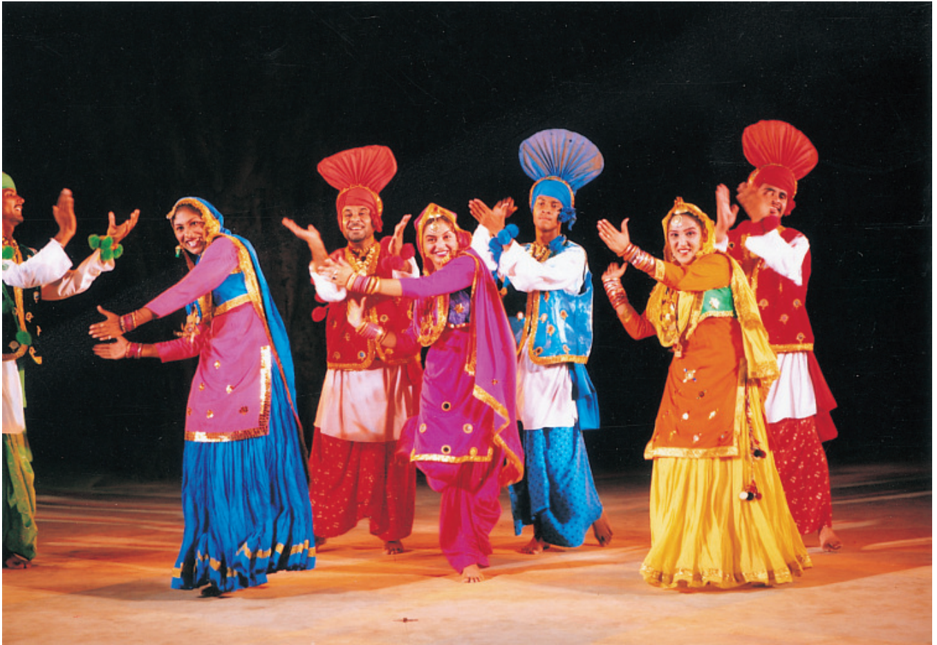
Giddha, a folk dance of Punjab.