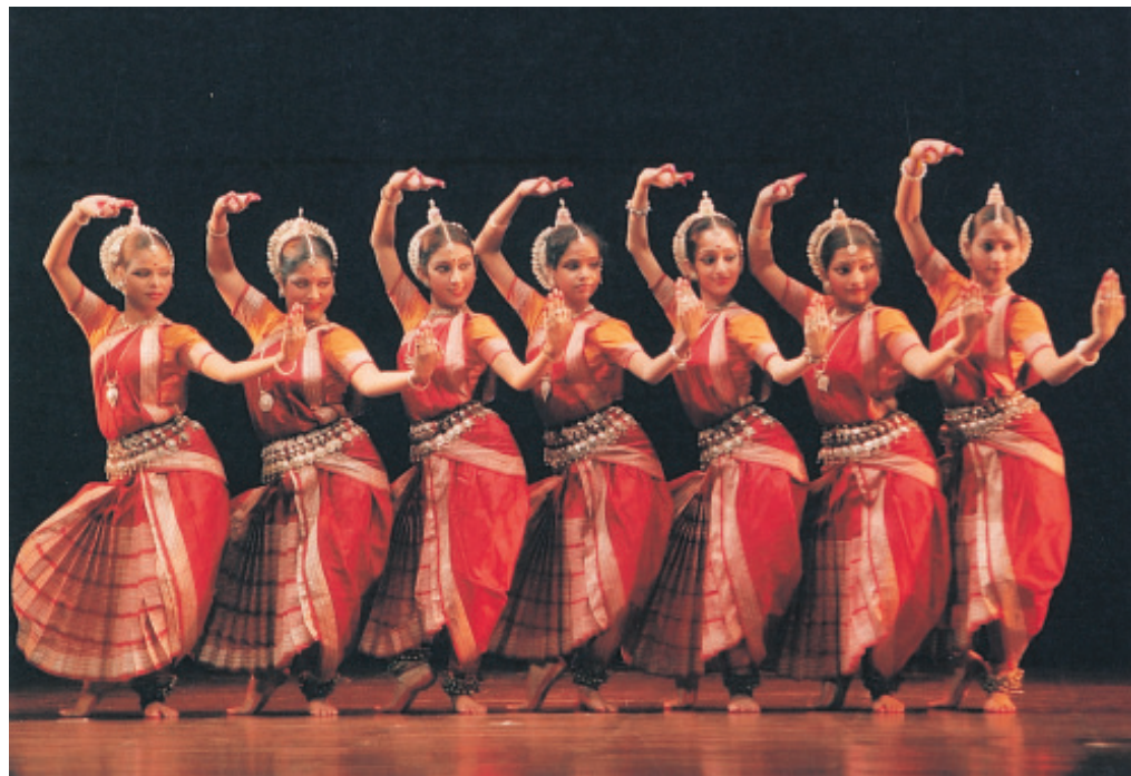
An Odissi dance presentation.