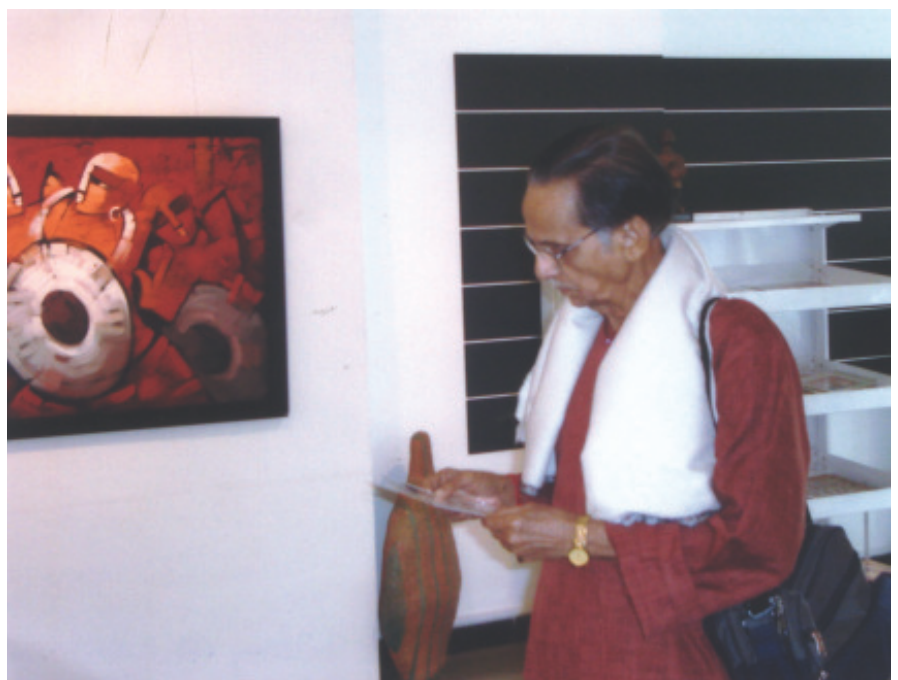
Bottom right: Shri Kavalam Narayana Panikkar, Vice-Chairman, Sangeet Natak Akademi, visited Kala Chhaya — a Cultural Centre for Education, Performance and Research in Performing and Fine Arts, Pune — on 15 August, 2007. He is seen watching exhibits at the art gallery.